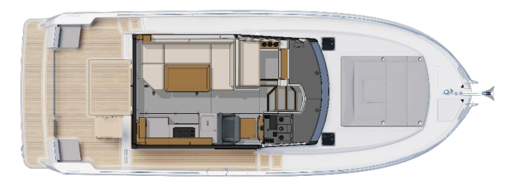
Main deck - Standard