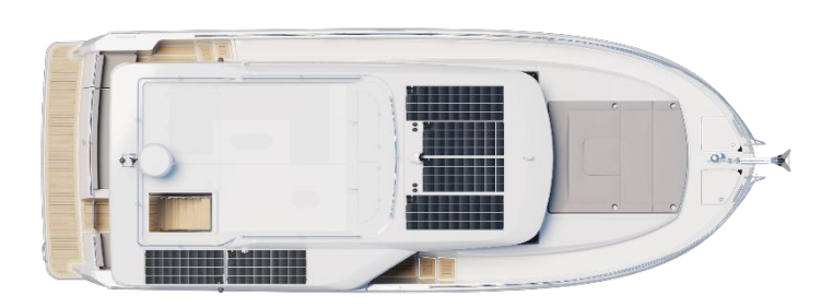
Sedan - Silent boat option