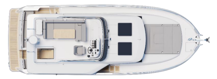
Flybridge – Skylights option