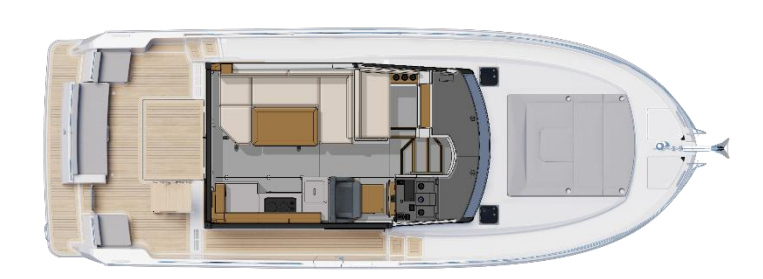
Main deck - Cockpit sliding bench seat option