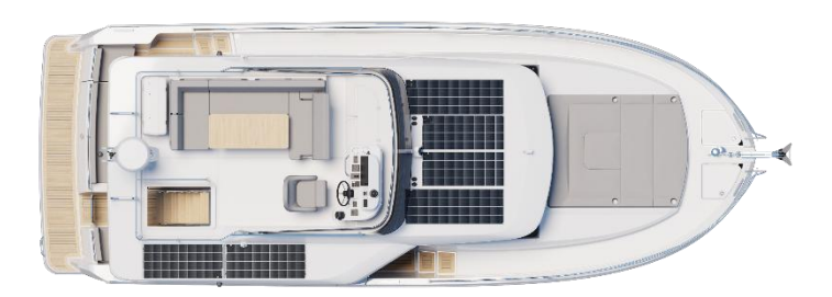
Flybridge - Silent boat option