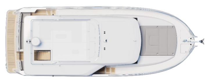
Sedan - Standard