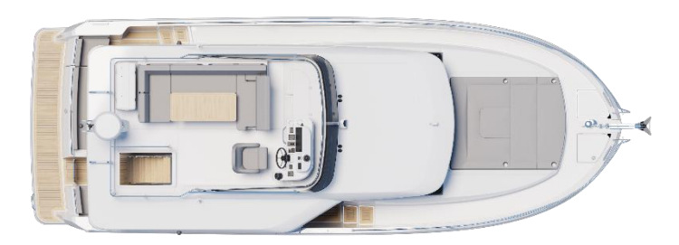
Flybridge - Standard