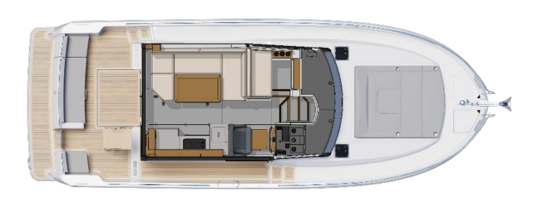
Main deck - Cockpit sliding bench seat option