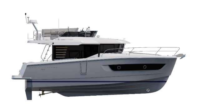
Hull Signal Grey - Flybridge