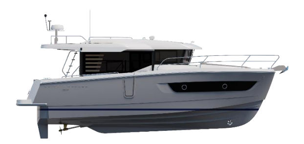
Hull Signal Grey - Sedan