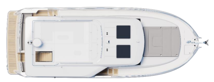
Sedan - Skylight option