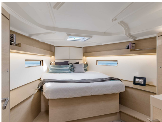
Oceanis 40.1 - Oceanis 40.1 (gite) - Rendimiento