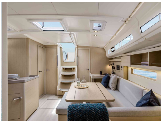
Oceanis 40.1 - Oceanis 40.1 (gite) - Rendimiento