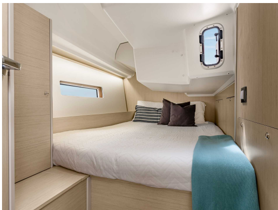
Oceanis 40.1 - Oceanis 40.1 (gite) - Rendimiento