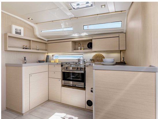
Oceanis 40.1 - Oceanis 40.1 (gite) - Rendimiento