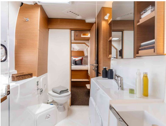
Excess 11 - Mention obligatoire/fandatory credit: Photo Nicolas Claris