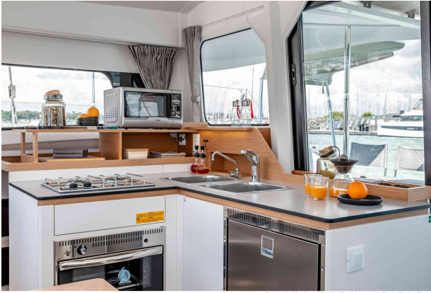
Excess 11