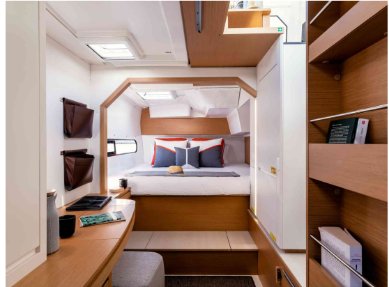
Excess 11