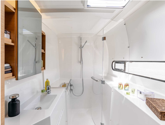
Excess 11