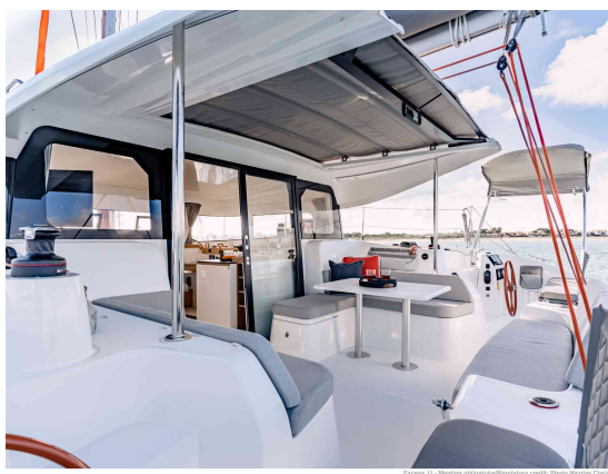
Excess 11 - Sirena deligant/Inventory credit Photo Nacra Club