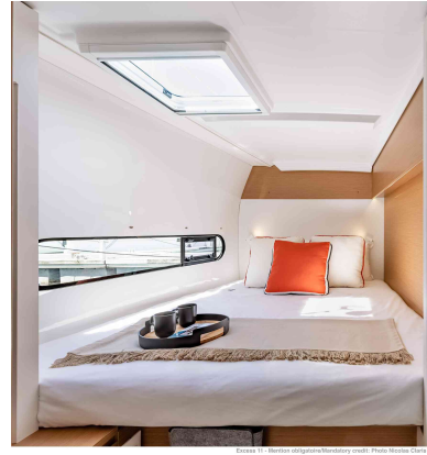
Excess 11 - Mention obligatoire/fandatory credit: Photo Nicolas Claris