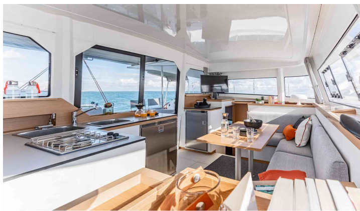
Excess 11 - Mention obligatoire/Mandatory credit: Photo Nicolas Clarte