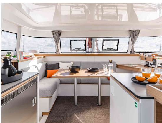
Excess 11