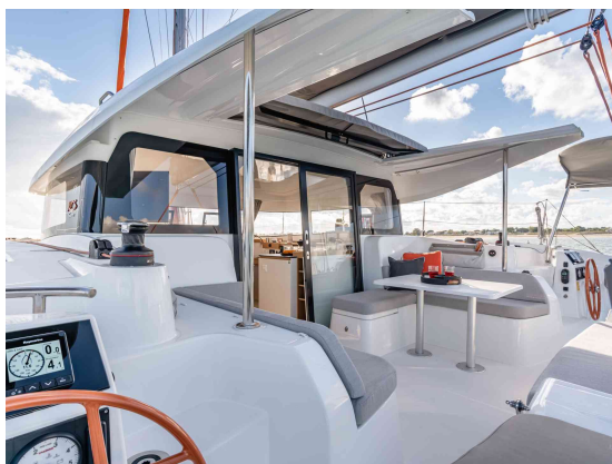
Excess 11 - Sirena deligant/Inventory credit Photo Nacra Club