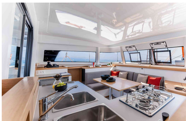
Excess 11