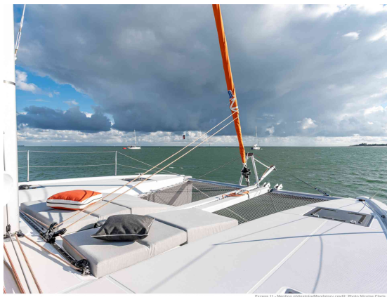
Excess 11