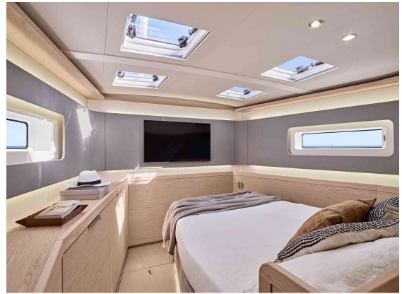
First 44