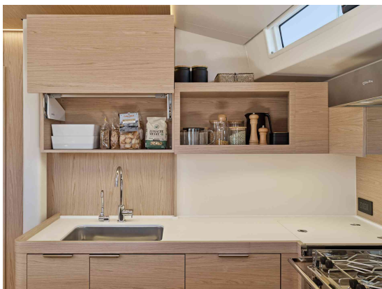
Octaris Yacht 60