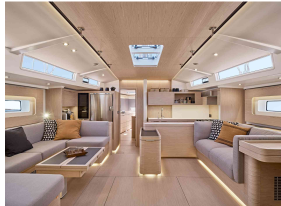
Octaris Yacht 60