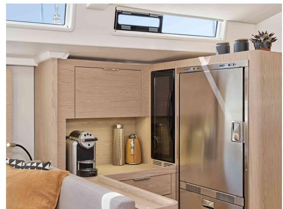
Octaris Yacht 60