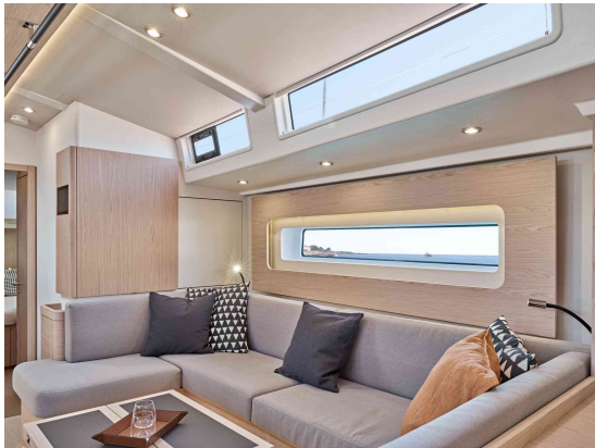
Octaris Yacht 60