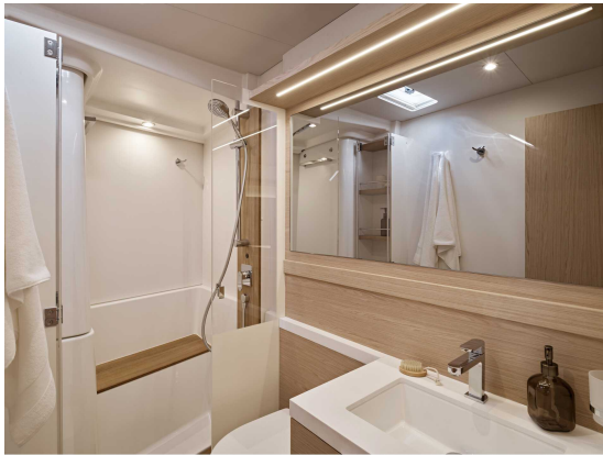
Oceanis Yacht 60