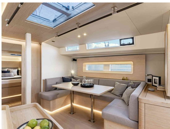
Oceanis 54 - Benetton yachts - Benetton credit Photo Nicolas Carls