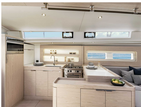
Oceanis 54 - Benetton yachts - Benetton