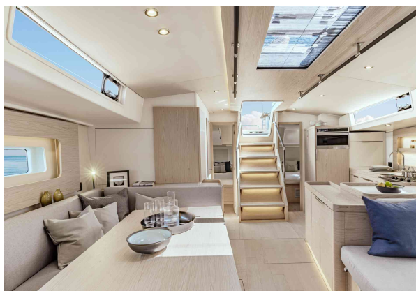
Oceanis 54 - Benetton yachts - Benetton