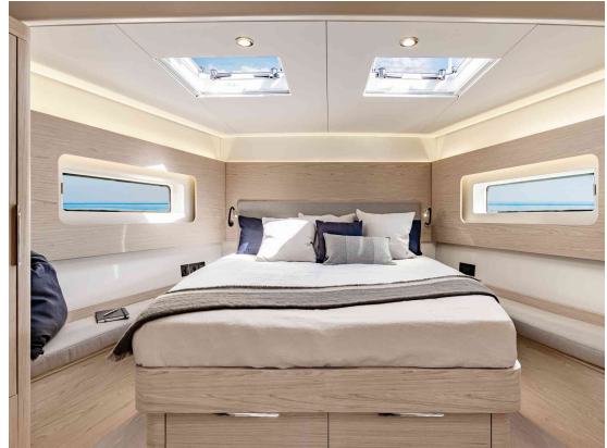
Oceanis 55 - Horizon-Eligant - Standard credit Photo Nicolas Carls