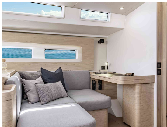
Oceanis 54 - Benetton yachts - Benetton