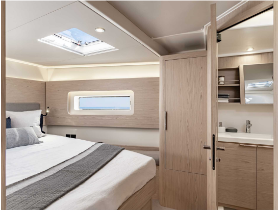
Oceanis 55 - Horizon-Eligant - Standard credit Photo Nicolas Carls