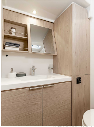
Oceanis 55 - Horizon-Eligant - Standard credit Photo Nicolas Carls