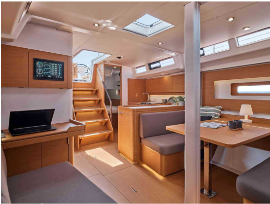
Photo: Jacques Bénéteau - First 44 - Mention obligatoire - Mandatory credit: Photo Nicolas Curi