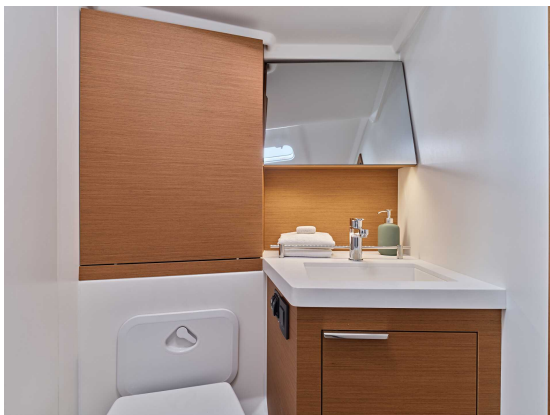
First 44