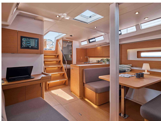
First 44