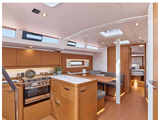
First 44