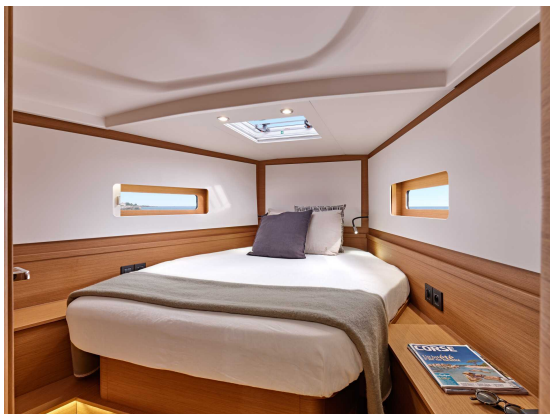
First 44