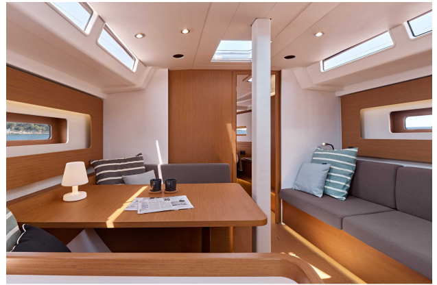
Photo: Jacques Bénéteau - First 44 - Mention obligatoire - Mandatory credit: Photo Nicolas Curi