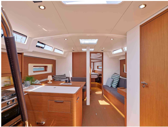
Photo: Jacques Bénéteau - First 44 - Mention obligatoire - Mandatory credit: Photo Nicolas Curi