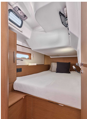
First 44