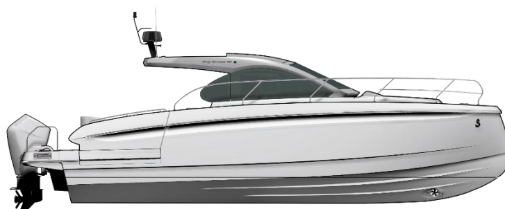
Profil - OB