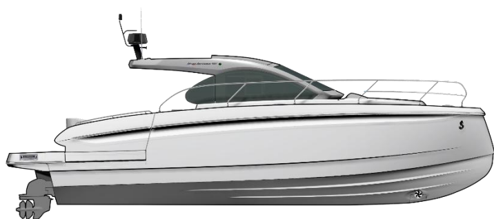
Profil - IB

*inclus support radar / included radar support