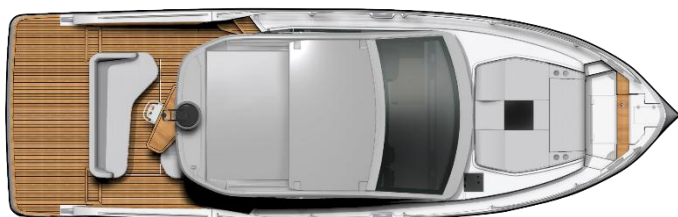
Hard top - IB