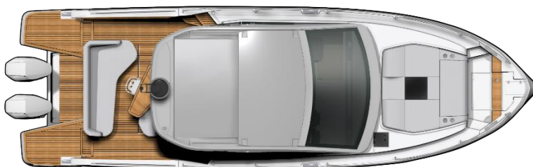
Hard top - OB