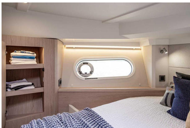
Benetton Swift Tracker 41