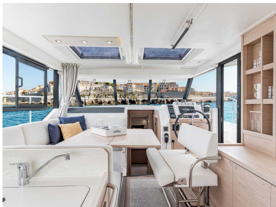
Benetton Swift Tracker 41